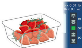
Quantity just right