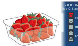
Quantity too large